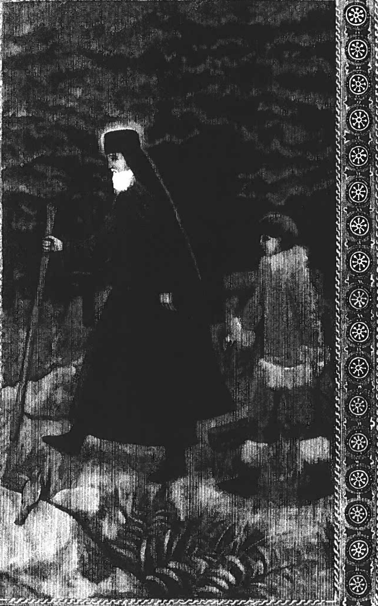
Illustration of St. Vincent and Anastase, Saint Herman of Alaska, Inspector of Holy Prayers, Ash Grove, Mo., 2003